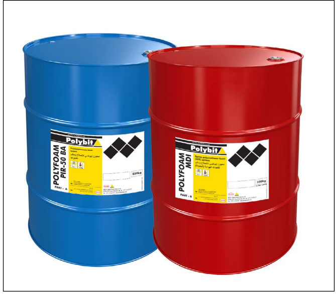
TDS_Polyfoam PIR-50 BA_GCC_0519 1

Store at room temperature in sealed drums. Moisture will react with this component to produce a surface skin of polymerized material. Protect from moisture and moisture vapour. Close all drums after use. Maximum permissible storage time is 6 months. The ideal storage temperature