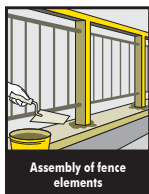
Assembly of fence elements