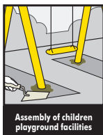
Assembly of children playground facilities