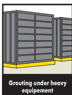
Grouting under heavy equipment