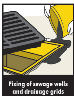
Fixing of sewage wells and drainage grids