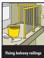
Fixing balcony railings