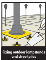
Fixing outdoor lampstands and street piles