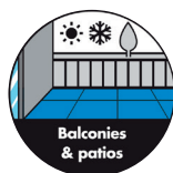
Balconies & patios